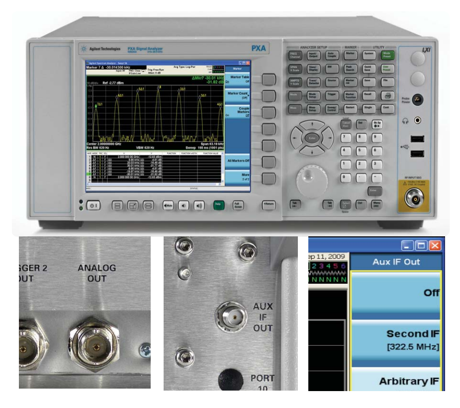
FIGURE 1: The PXA features super-wide IF technology and outstanding measurement accuracy, \pm 0.19 -dB accuracy and a low noise floor DANL of -172 dBm with preamp (-160 dBm with no preamp) at 2 GHz for superior useable dynamic range. Compatibility is enhanced with a flexible analog output and a selectable-frequency IF output.

Additionally, the PXA offers an advanced compatibility mode that allows engineers to constrain the analyzer to a certain setup or configuration to match their legacy analyzer. A mode enabling the duplication of legacy couplings or setup connections is also provided. Engineers can even opt to deviate selectively from their setup connections to improve the measurements without messing up their test system. Such features enable the PXA to deliver compatibility without limitations.