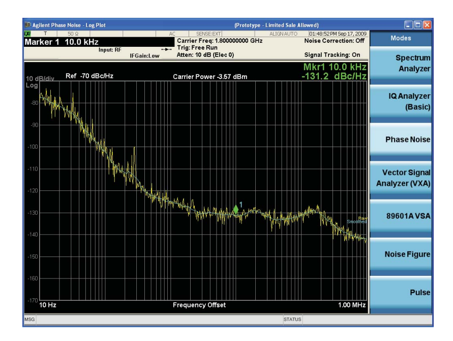
FIGURE 2: This measurement reflects the built-in functionality and the performance of the Agilent PXA (using an external reference), where a fast and automatic phase noise measurement yields -131 dBc/Hz at 10 kHz and -77 dBc at 10 Hz, at a carrier frequency of 1.8 GHz.

Another measurement application that's critical to the aerospace/defense industry is pulse analysis. Engineers can access this measurement on the PXA to characterize their pulsed-RF signals in the time domain. It automatically finds pulse edges in time and then measures parameters such as rise time, fall time, pulse width, PRI (interval), PRF, duty cycle, and peak-to-average ratio, along with several others.