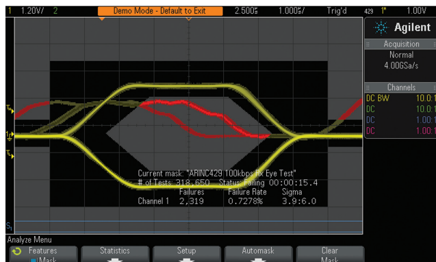
Figure 2: Testing the signal integrity of a differential ARINC 429 serial bus using eye-diagram mask testing.

Figure 2 shows an ARINC eye-diagram mask test performed at the input of a remote receiver. The scope repetitively captures and overlays all 32 bi-level RZ bits of every word. In this example, we can see some bits failing the mask test due to bit timing shift and reduced amplitude. This is an indication that we probably have a signal integrity problem in our system.