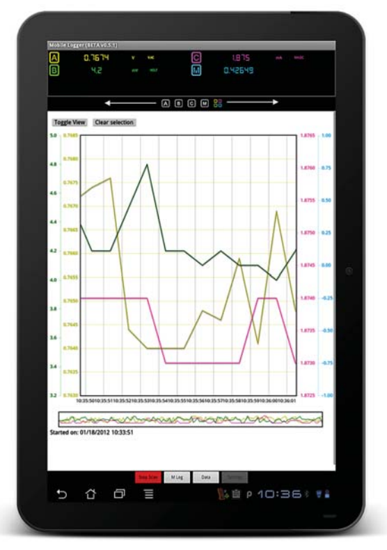
Figure 6. Agilent Mobile Logger Application on a tablet PC