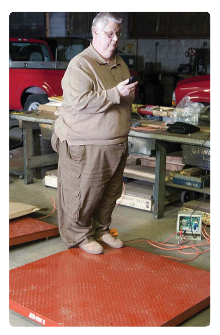
Figure 3. Identify a bad load cell with corner testing

each time they move. Sometimes, the scale troubleshooting task is not limited to just the workshop and requires technicians to perform scale troubleshooting outdoors, even if it is raining or snowing. This situation is worse if technicians need to view more than one meter reading at the same time. If the weight indicator is mounted in a control cabinet, viewing the weight indicator from the scale platform is completely impossible. Such conditions make troubleshooting tedious.