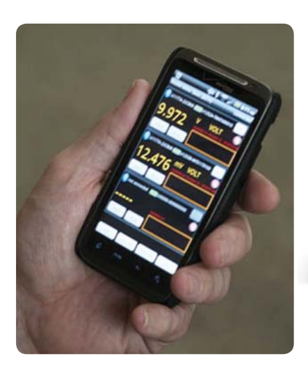
Figure 5: Agilent Mobile Meter Application On Android Phone