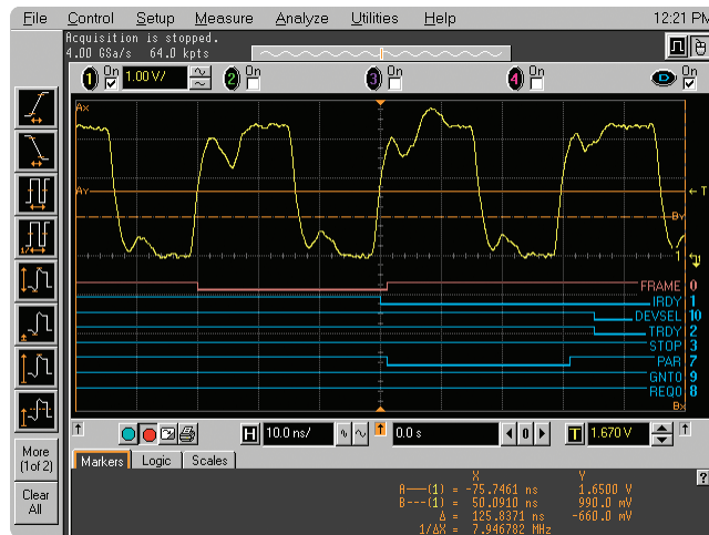
Figure 3. The CLK signal (yellow trace) shows potential signs of signal integrity issues.

Triggering on the address phase of device 1, however, revealed a problem with the clock pulse that preceded the address phase clock. This is the clock that samples the FRAME# signal when it is first asserted. Figure 4 clearly shows an anomaly dropping below the trigger level and the VOut marker. This is an indication that the CLK occasionally sampled twice, instead of just once. Coupling between the device lines and the CLK line caused the dip in the CLK signal (figure 3). Activity on device 1 caused the coupling to increase. This extra coupling was enough to drive the CLK signal below acceptable limits intermittently.