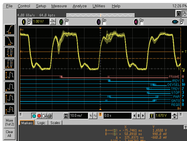
Figure 4. On the CLK signal, an anomaly dropped below the trigger level and the VOut marker.