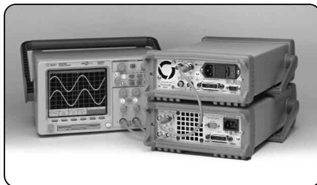
Figure 1: A 33120A (top) receiving an external reference signal from a 33250A (bottom).

If you want to combine multiple 33120As, you need to add optional external reference and BNC connectors (Option 001) to each generator so they will accept the external reference. If you already own a 33120A, you can look at the rear panel and determine if it has the optional BNC connectors below the labels “Ext Ref In” and “Ref Out.” If your 33120A does not have Option 001 installed, usually it