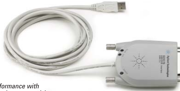
Boosting performance with simplest connectivity