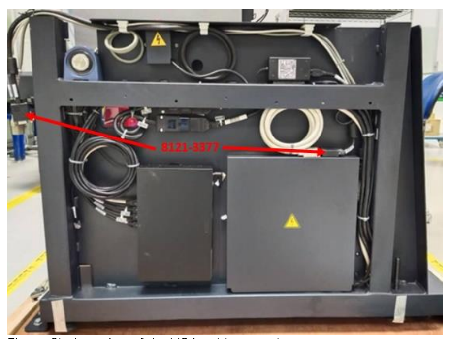
Figure 3b: Location of the VGA cable to replace