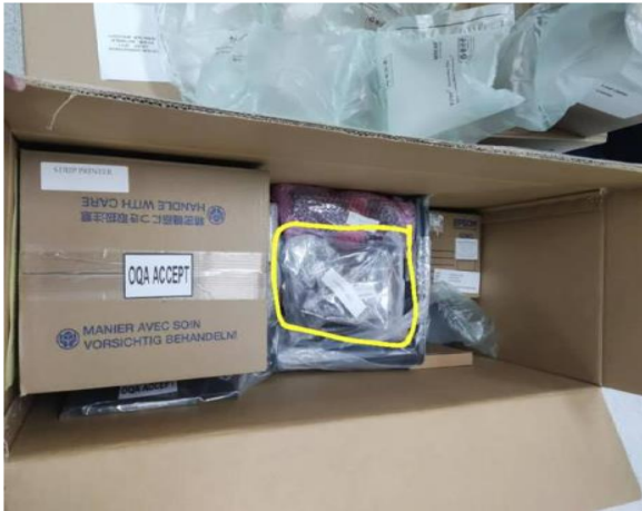
Picture1: Yellow box indicates the position of the EMC covers in the accessory box.

EMC covers E9901-00204and E9901-00205 will be packed into accessory box for shipment.