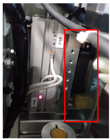
Figure 1: Runner Block and Rubber support hard-stop.

When the Press moves to "All probe" position, the secondary Press (Figure 2) will have some force acting upon the rails. There is a perception that this force may cause significant impact to the conveyor rails over the longer term.