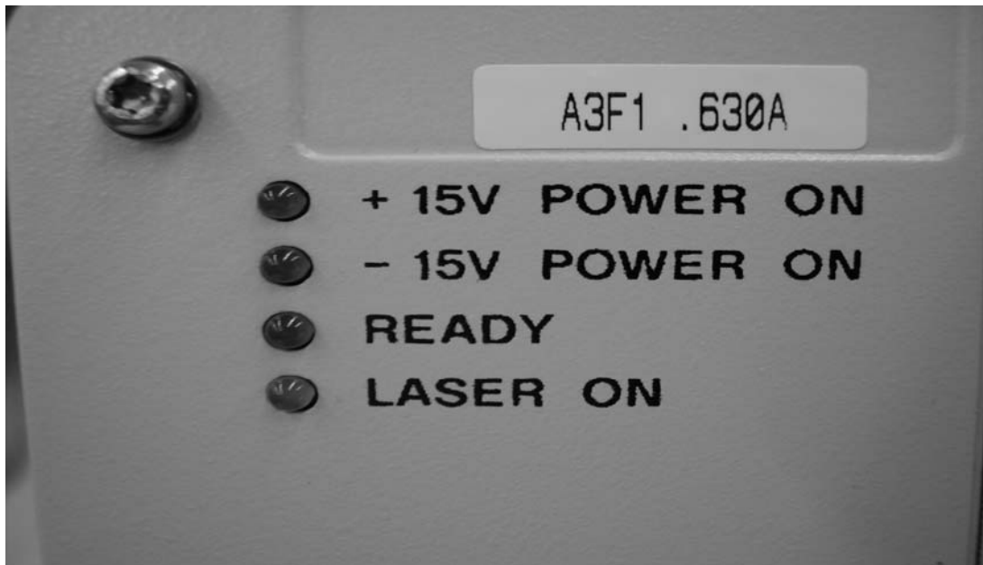
Picture shows placement of label.