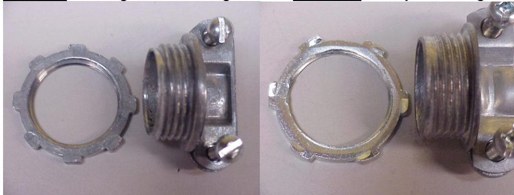
Figure 4 Heyco locking Nut

Figures 4 & 6 is representative of a nut with locking ribs.