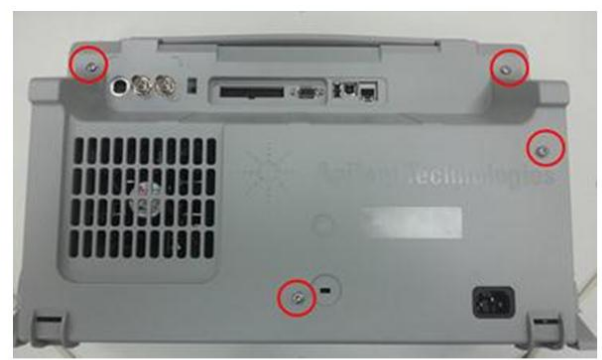
Old revision cabinet