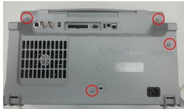
New revision cabinet