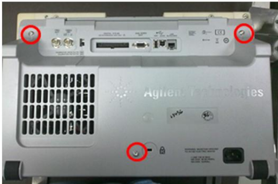
Old revision cabinet