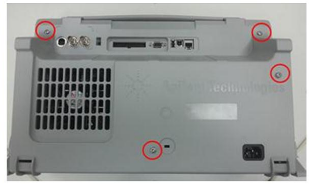
Old revision cabinet