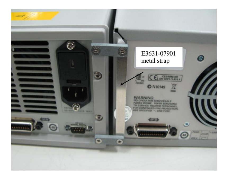
Figure 5: Rear view rear lock link secured with metal straps kit for side-by-side rack mounting

Use metal strap (part number E3631-07901), and stack the provided two metal straps together to form 3mm thickness and secure it with the provided screws on the rear lock link as shown in Figure 5 below.