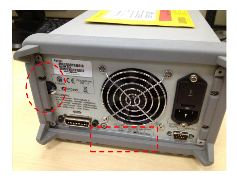
Figure 1: Loose rear bumper – gap observed between bumper and chassis

There is a new rear bumper design starting from serial number MY51250037. The rear bumper may become loose or it may slip out of the instrument chassis when force is applied to the rear bumper, as shown in Figure 1 below.