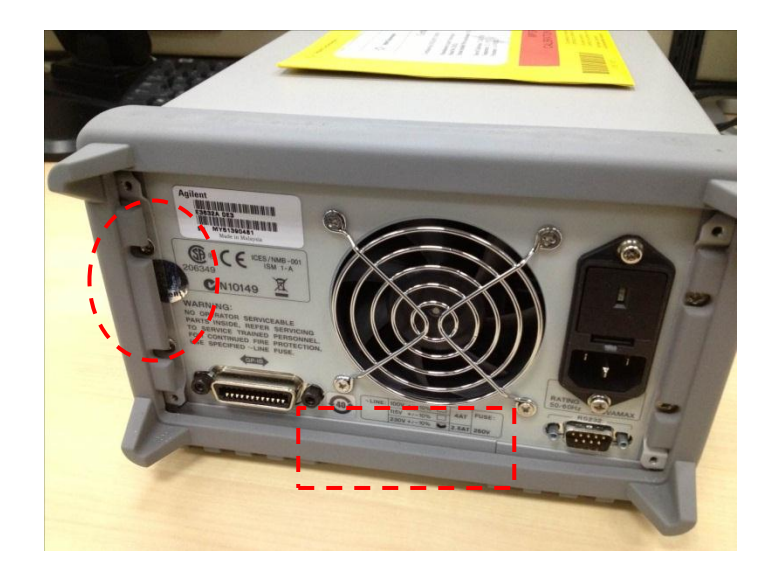
Figure 1: Loose rear bumper – gap observed between bumper and chassis

There is a new rear bumper design starting from serial number MY51240076. The rear bumper may become loose or it may slip out of the instrument chassis when force is applied to the rear bumper, as shown in Figure 1 below.