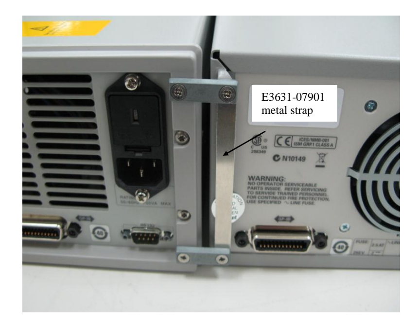
Figure 4: Rear view rear lock link secured with metal straps kit for side-by-side rack mounting

Use metal strap (part number E3631-07901), and stack the provided two metal straps together to form 3mm thickness and secure it with the provided screws on the rear lock link as shown in Figure 4 below.