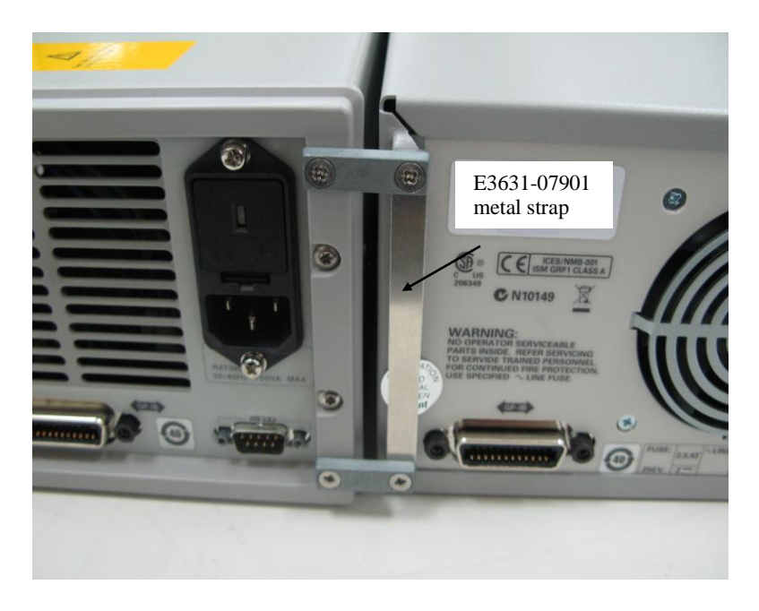
Figure 5: Rear view rear lock link secured with metal straps kit for side-by-side rack mounting

Use metal strap (part number E3631-07901), and stack the provided two metal straps together to form 3mm thickness and secure it with the provided screws on the rear lock link as shown in Figure 5 below.