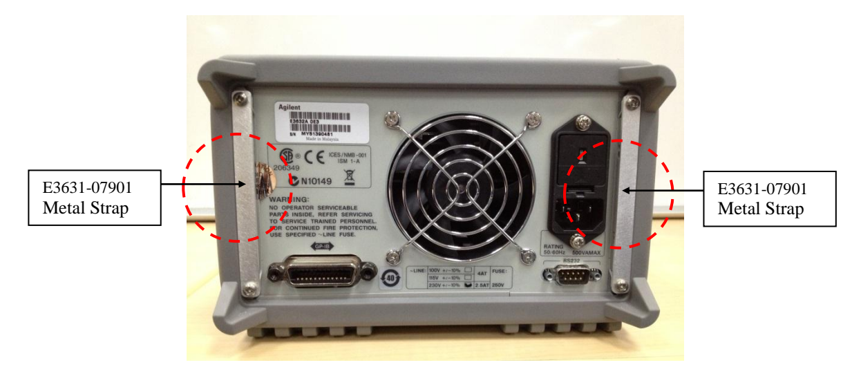
Figure 3: Secure with metal straps – no gap observed between the bumper and chassis

Use two metal straps (part number E3631-07901) to secure each side of the bumper as shown in Figure 3 below.