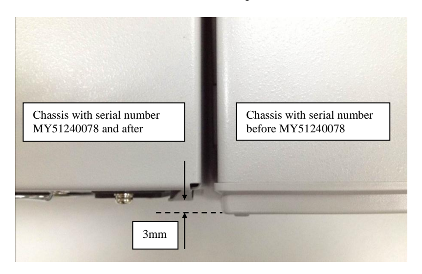
Figure 1: Top view 3mm gap observed between two different chassis designs