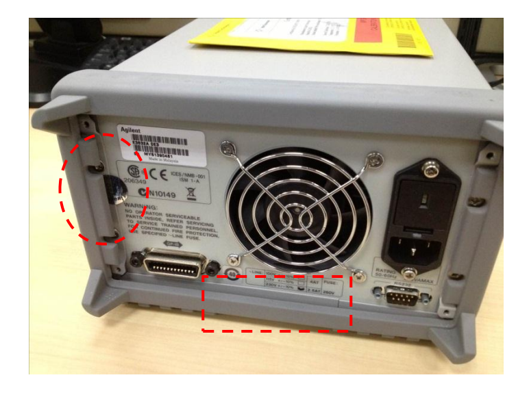
Figure 1: Loose rear bumper – gap observed between bumper and chassis

There is a new rear bumper design starting from serial number MY51240078. The rear bumper may become loose or it may slip out of the instrument chassis when force is applied to the rear bumper, as shown in Figure 1 below.