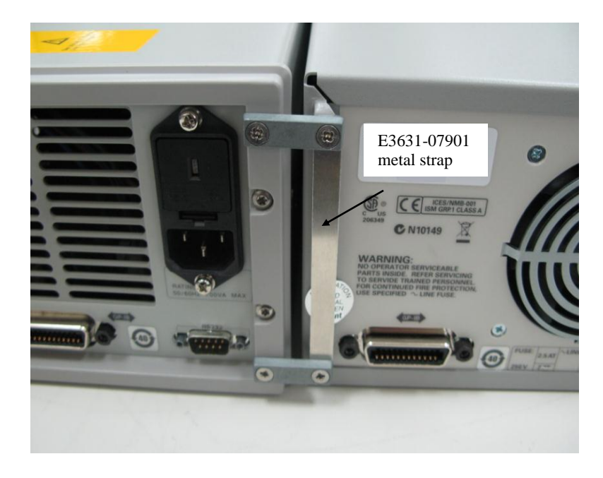
Figure 4: Rear view rear lock link secured with metal straps kit for side-by-side rack mounting

Use metal strap (part number E3631-07901), and stack the provided two metal straps together to form 3mm thickness and secure it with the provided screws on the rear lock link as shown in Figure 4 below.