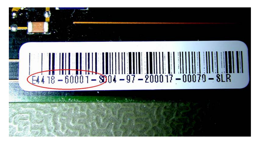
Figure 1. Label Example