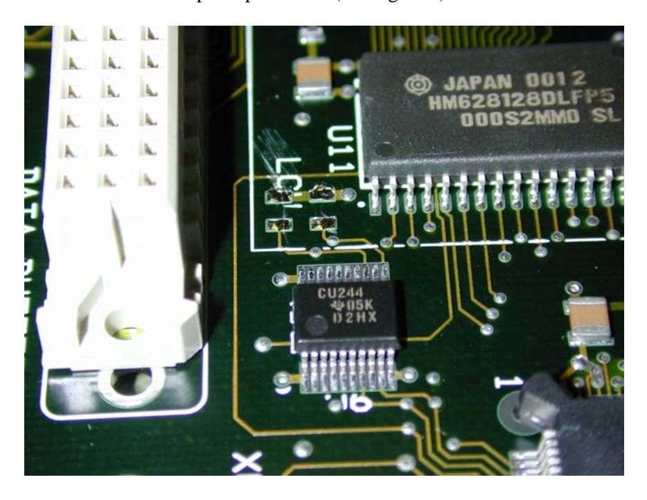
Figure 3. Surface Mount Resistors Removed from Board

5. Remove the two surface mount pull-up resistors (see Figure 3).