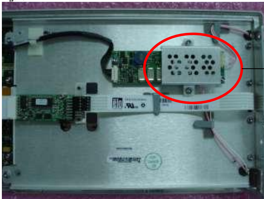
Figure 1: Old inverter shield N5230-00013