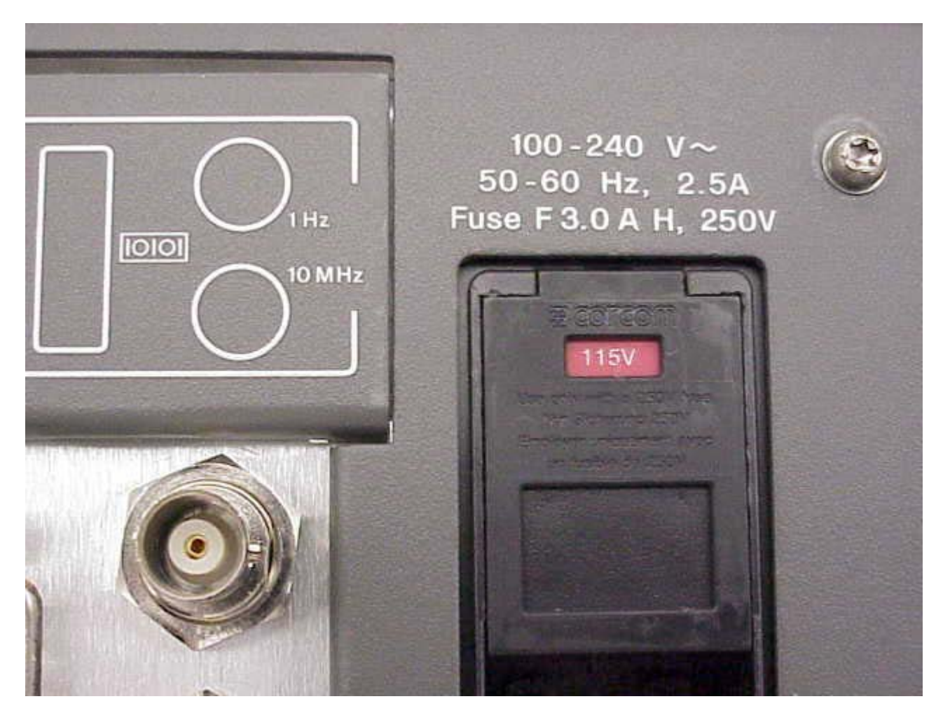
Photo #1 Note: If your unit is EC 11:00 AND has the 115V visible in the window, stop here as this unit already has two fuses.