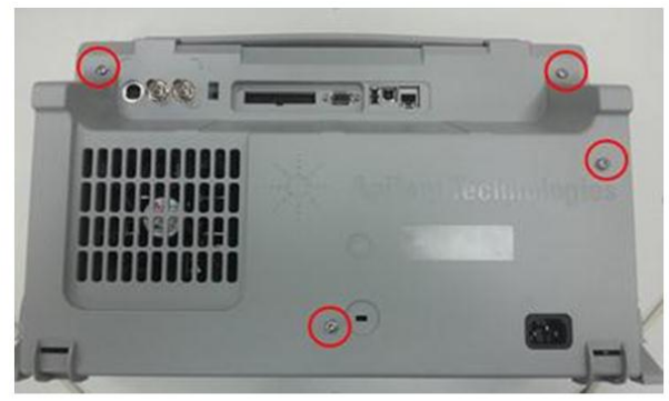
Old revision cabinet