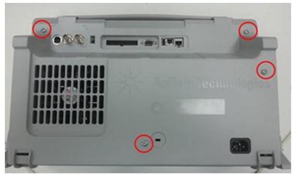
Old revision cabinet