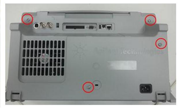
Old revision cabinet