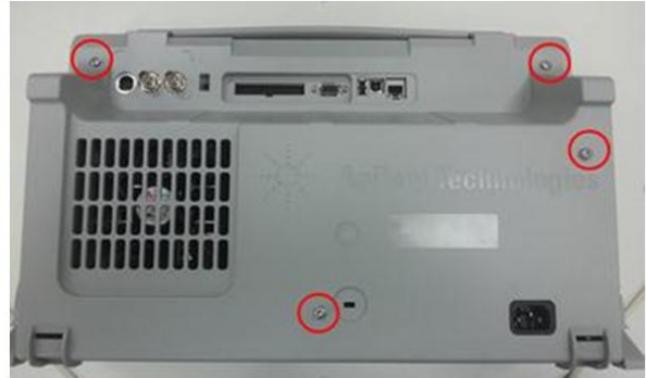
Old revision cabinet