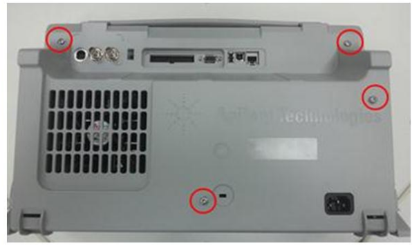
Old revision cabinet