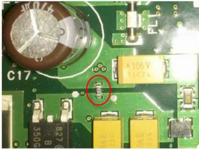
R1357 before modification