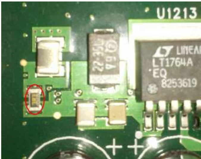
R1525 before modification