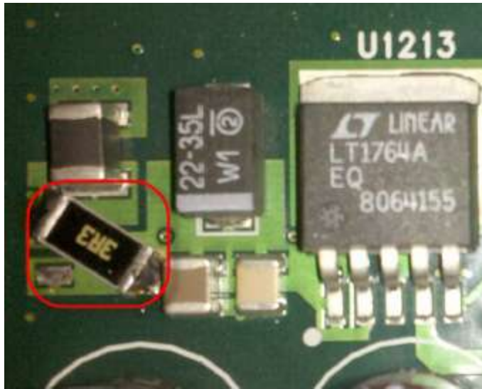
R1525 after modification