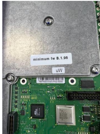
Figure 3 – Location of label on the RF assembly

Factory has also made an identification, where a label “minimum FW B.1.96” is pasted on the shield, as shown in Figure 3.