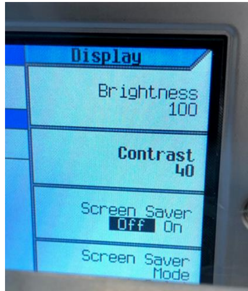
Figure 4 - Contrast Adjustment