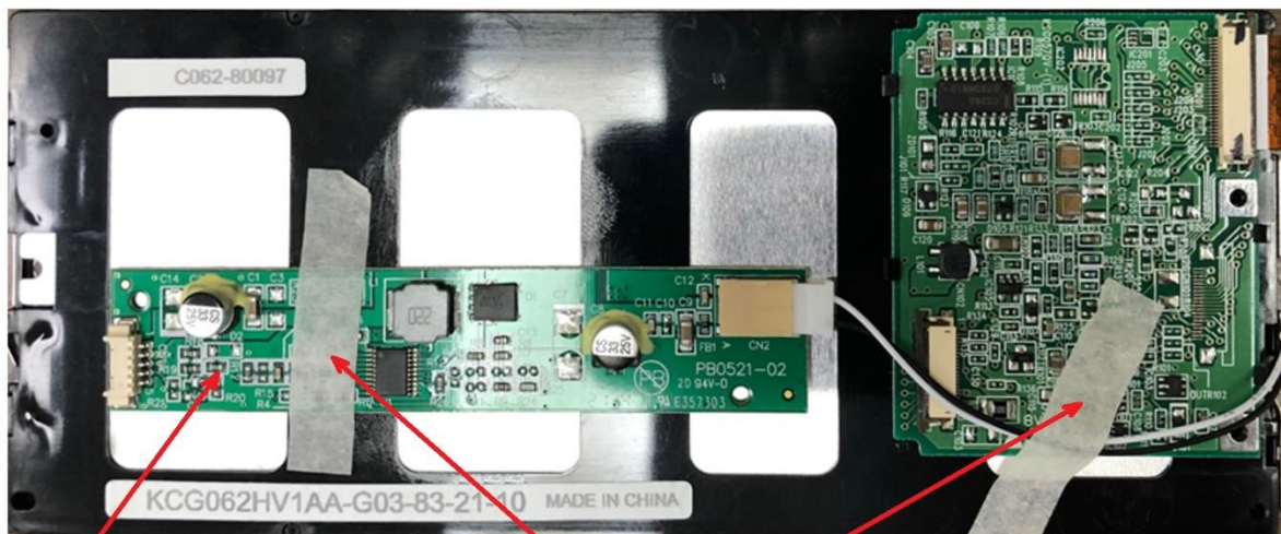
Figure 1 - Replacement LCD and Backlight Driver Board