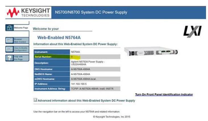
Figure 1: Serial number is "0" in WebUI

However, there is no impact on the functionality and specification of the instrument.