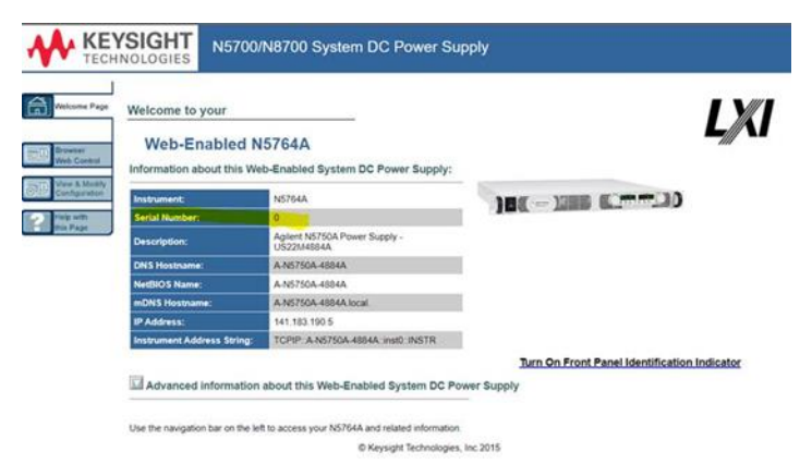
Figure 1: Serial number is "0" in WebUI

However, there is no impact on the functionality and specification of the instrument.