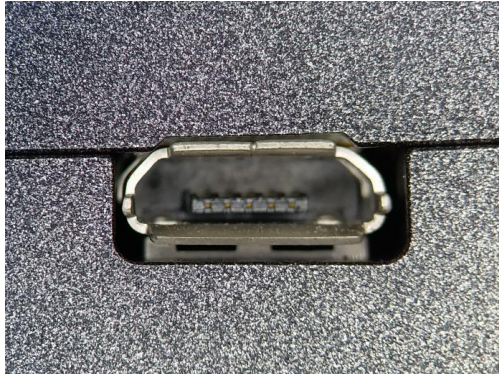
With Secure Block

If a rework has already been done, it can easily be identified by looking at the USB connector, refer to the image below.