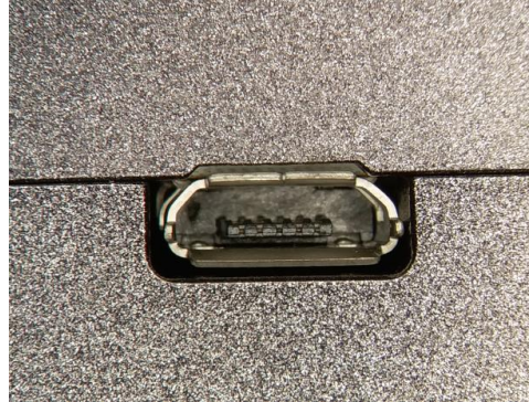
Without Secure Block