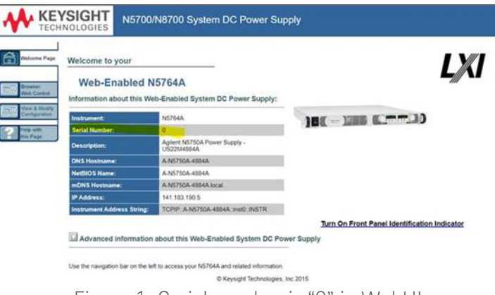
Figure 1: Serial number is "0" in WebUI

However, there is no impact on the functionality and specification of the instrument.