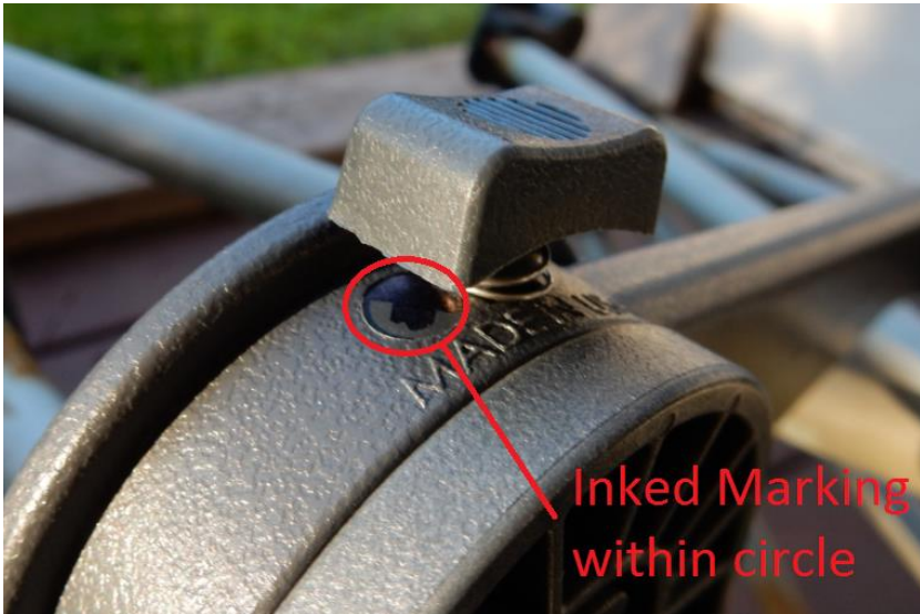
Figure 2. Circle with inked marking. This handle is OK.

Figures 2 and 3 also show a close-up of the area around the hub of the bail handle assembly of later production units. Note the ink marking or an embossed ridge through the center of the circle.