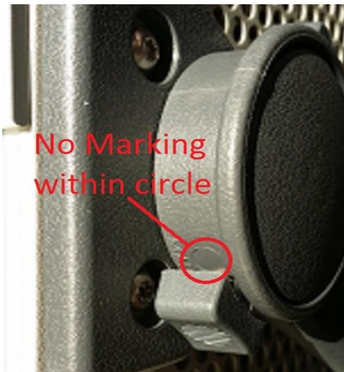
Figure 1. Circle with no markings. This handle should be replaced.

Replace the bail handle assembly with a known-good assembly. Figure 1 shows a close-up of the area around the hub of the bail handle assembly, near one of the buttons to rotate the handle. Look for the button that has “MADE IN USA” embossed near it. Note the circular feature in the bail handle. If there is no mark inside the circle, the bail handle assembly is an early production unit and must be replaced and destroyed to prevent it from being used again.