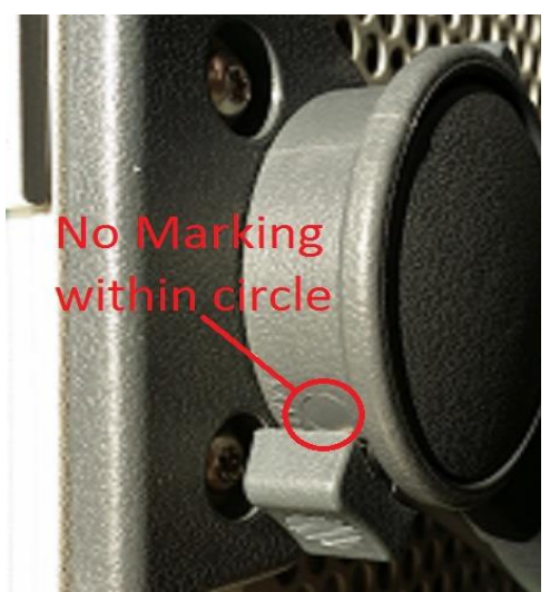
Figure 1. Circle with no markings. This handle should be replaced.

Replace the bail handle assembly with a known-good assembly. Figure 1 shows a close-up of the area around the hub of the bail handle assembly, near one of the buttons to rotate the handle. Look for the button that has "MADE IN USA" embossed near it. Note the circular feature in the bail handle. If there is no mark inside the circle, the bail handle assembly is an early production unit and must be replaced and destroyed to prevent it from being used again.