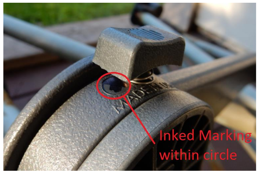
Figure 2. Circle with inked marking. This handle is OK.

Figures 2 and 3 also show a close-up of the area around the hub of the bail handle assembly of later production units. Note the ink marking or an embossed ridge through the center of the circle.